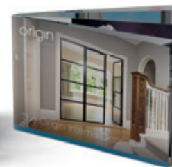
The Origin Internal Door Collection