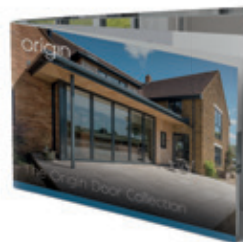
The Origin Door Collection

Order your literature today via our New Partners Team - newpartners@origin-global.com