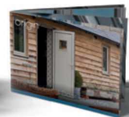
The Origin Residential Door Collection