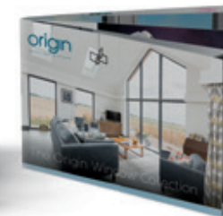
The Origin Window Collection