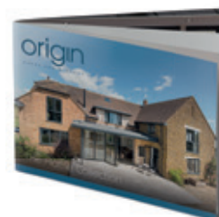
The Origin Home Collection Overview