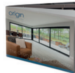
The Origin Sliding Door Collection